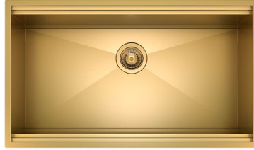
Sink Leonardo Gold 33" x 20" – U/M 1014 669